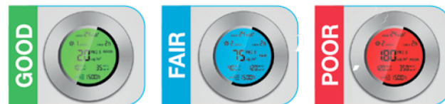
See Air Quality with COLOURVIEW™ Technology