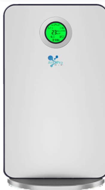
Floor Stand Included