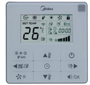
Wired Controller KJR29B (optional)