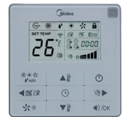
Wired Controller KJR29B (optional)