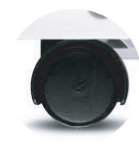
360° Castor Wheels