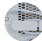
Power cord tidy design