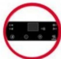
Touch Panel Controls