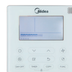
Wired Controller KJR-120X+MFCB