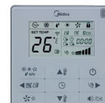
Wired Controller KJR29B