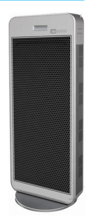
Floor Stand Included

Copyright © 2002 – 2020 Air Conditioning Centre / Martin Industries Air Conditioning Centre is a registered trademark of Martin Industries Ltd. E&OE. Registered in England & Wales Co. No. 05436428