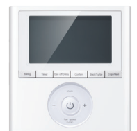
Wired Controller KJR-120G2-P&P (included) KJR-120G2-M2 (optional)